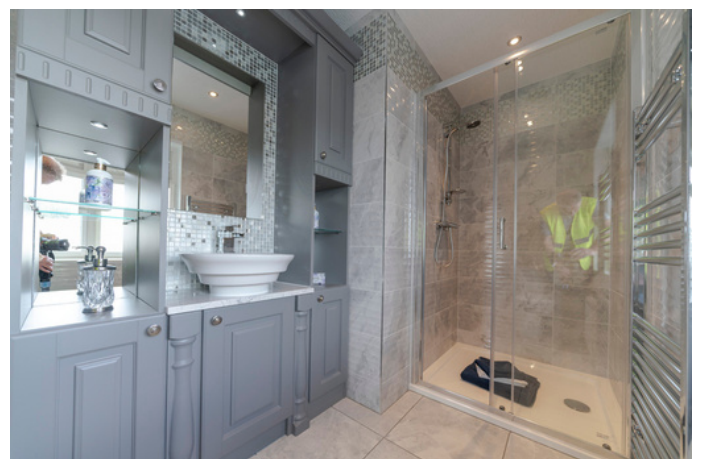
Please note: Stock images have been used, the home on site may differ.