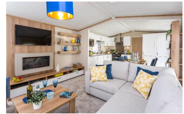
Marlow 38ft x 12ft - 2 bedroom