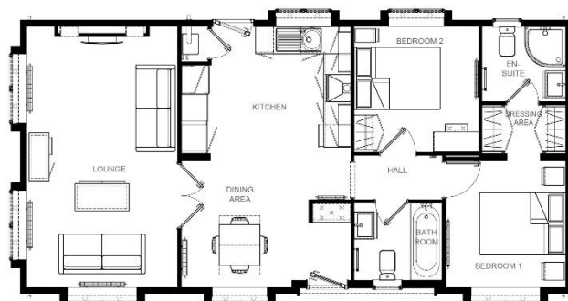
Image 40' x 20' 2DB