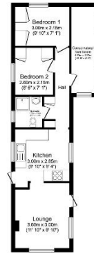
Total floor area 46.6 m 2 (501 sq.ft.) approx

This floor plan is for illustrative purposes only. It is not drawn to scale. Any measurements, floor areas (including any total floor area), openings and orientation are approximate. No details are guaranteed. They cannot be relied upon for any purpose and they do not form part of any agreement. No liability is taken for any error, omission or misstatement. A party must rely upon its own inspection(s). Powered by www.foxagent.com