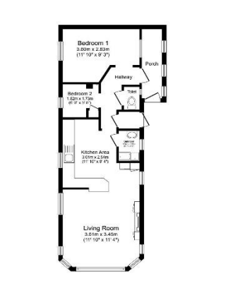
Total floor area 52.8 m<sup>2</sup> (569 sq.ft.) approx This four plan is for illustrative purposes only. It is not drawn to scale. Any measurements, floor areas (including any total floor areas), openings and orientation are approximate. No details are gap