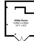
Utility Room Approx 11 sq m / 114 sq ft

Whilst every attempt has been made to ensure the accuracy of the floor plan contained here, measurements of doors, windows, rooms and any other items are approximate and no responsibility is taken for any error, omission, or mis-statement. The measurements should not be relied upon for valuation, transaction and/or funding purposes. This plan is for illustrative purposes only and should be used as such by any prospective purchaser or tenant.